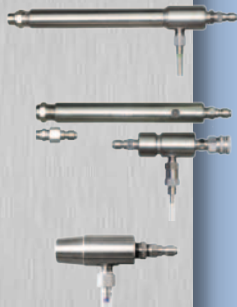
Pressure Washer Foamers & Sprayers