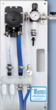
Wall Mount /Hand Transportable